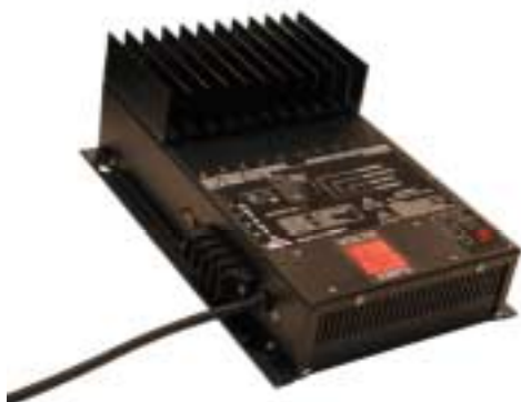
(Shown with Optional Digital Meter)