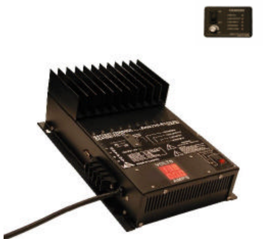
(Shown with Optional Digital Meter)