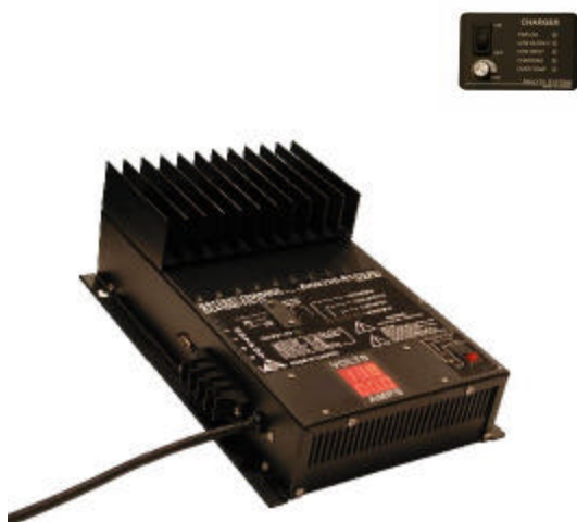
(Shown with Optional Digital Meter)